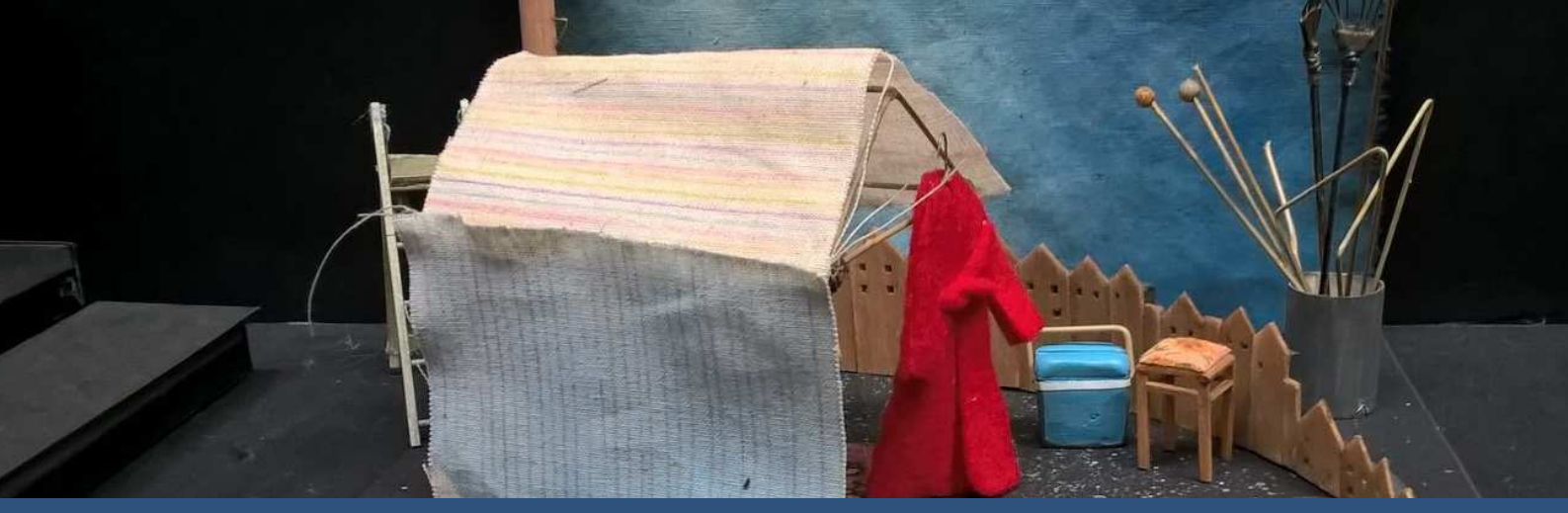
Building an inside den - from household objects

Why not help the children make their own den or wendy house in the classroom like Wendy, Michael and John for indoor camping, story telling and 'midnight feasts'?!