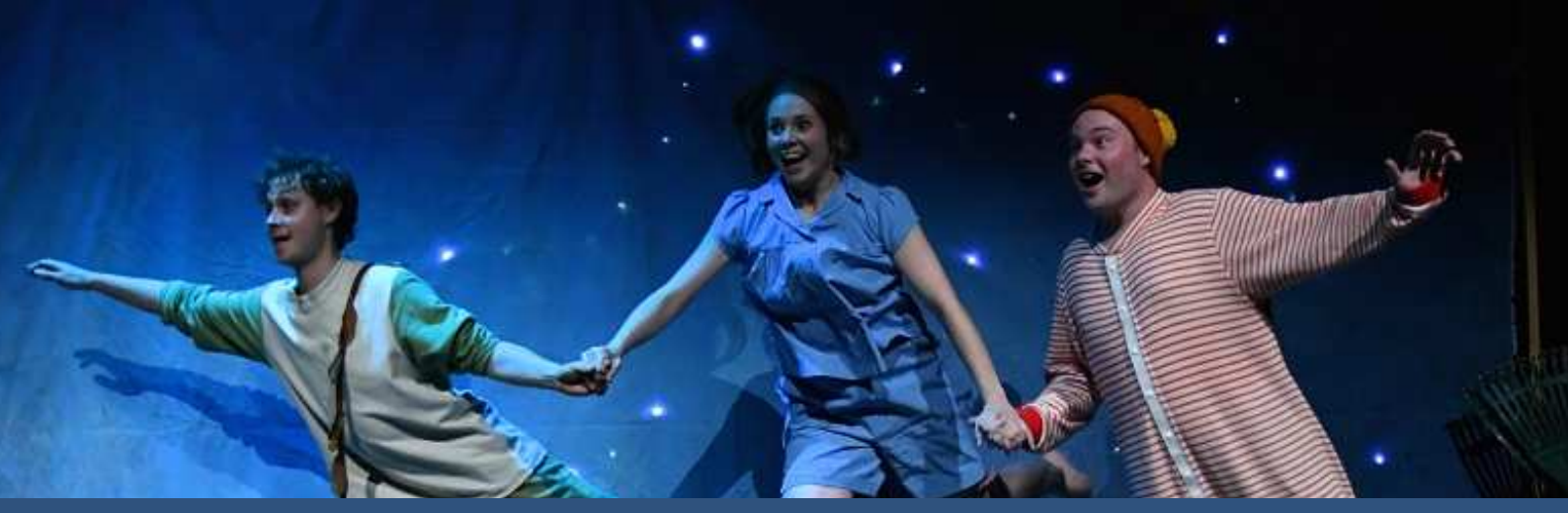
Underneath a Magical Moon – The Story