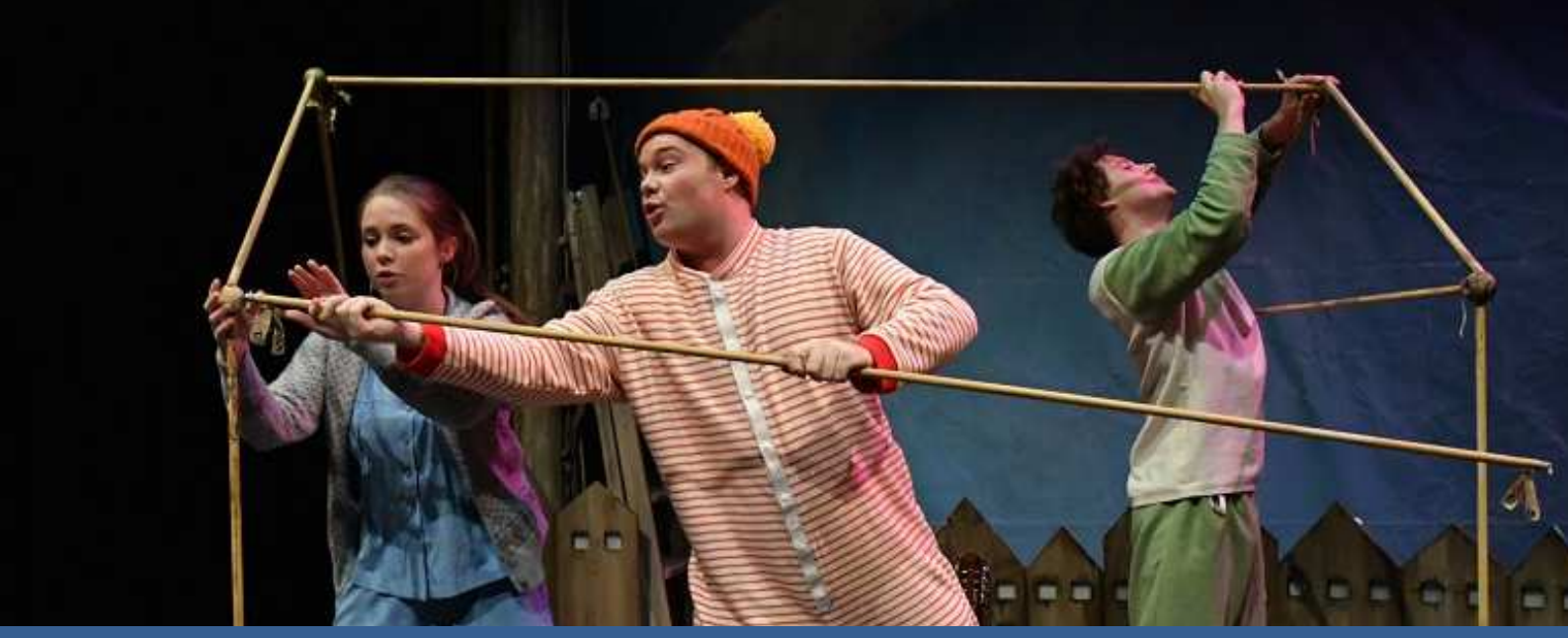
Activities to do straight after watching the play